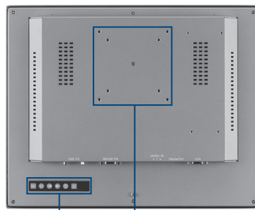
OSD Control Keys VESA Mount